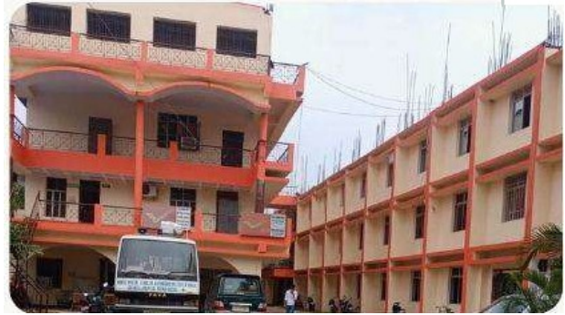
Late N.H. Rai Block, Dental Wing

The 14th day of April 1990 will remain as land mark in the history of field of dentistry of state of Bihar in particular, and nation as whole for, it was on this very auspicious day of birth centenary year of Bharat Ratna Late Baba Saheb Ambedkar the Institute took it's inception as a mark of memory and tribute to the great soul, who dedicated his life for the welfare & upliftment of poor and down trodden of the society. The institute being the first of its kind in the north-east region of the country, imparting vocational training in field of Dentistry under the banner of Late Baba - Saheb Bhim Rao Ambedkar, the great humanist, the pioneer of Indian freedom and the architect of modern India.