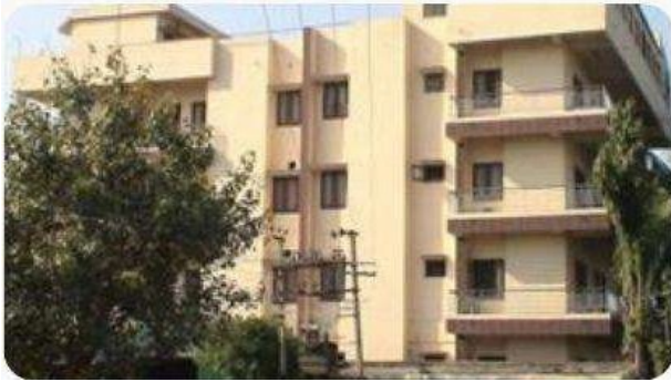
B. Devi Block, Girls Hostel